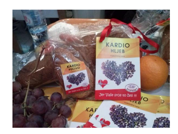
Cardio bread with polyphenol