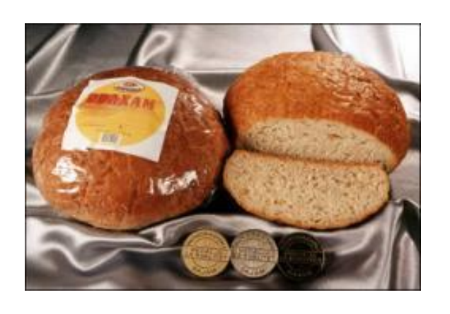
tost Rye bread