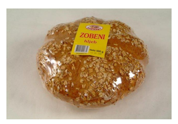
Oats bread Lower holesterol