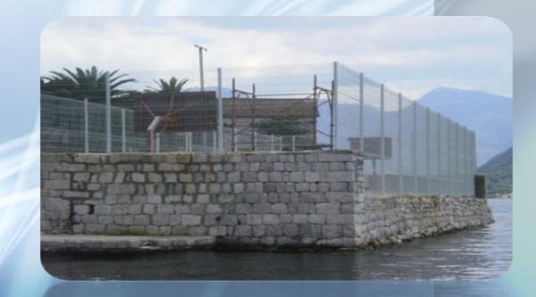
Coated fence panels