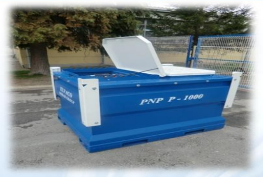
PNP (mobile oil pump)