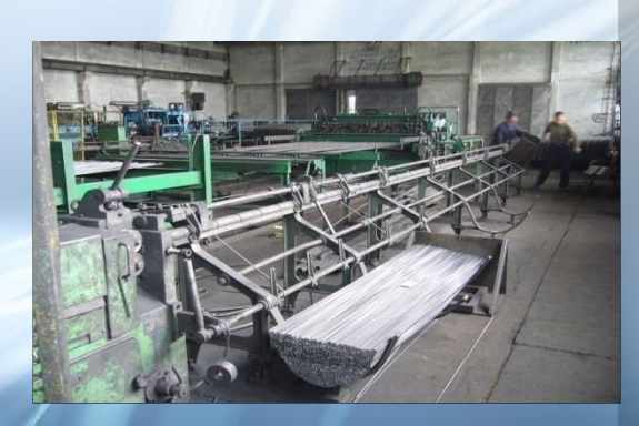
Straightened and cut wire