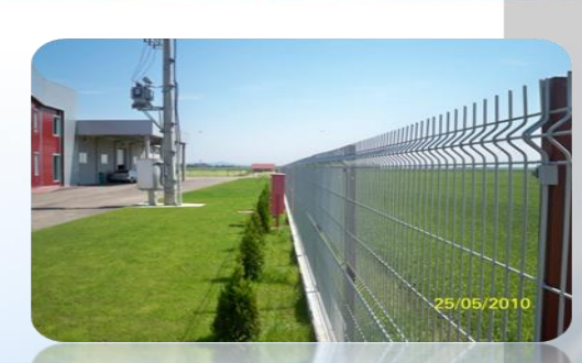
Coated fence panels