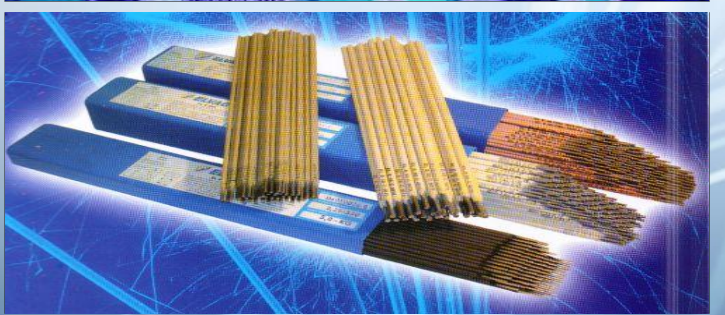
Classical and special welding electrodes