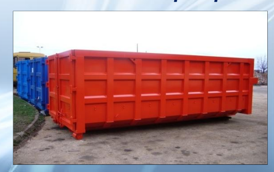
Roll containers for the waste storage