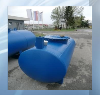
PNP (mobile oil pump)